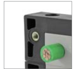
Also available with threaded bushings.